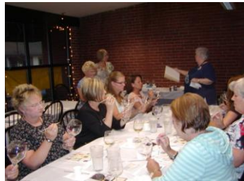
The group is concentrating