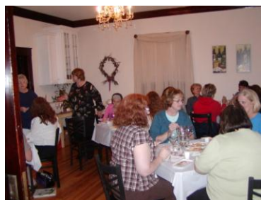
They are having fun !!