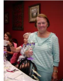
another happy painter.

The next paint-in was held at Unkorked in Wentzville - there we had 15 in attendance.