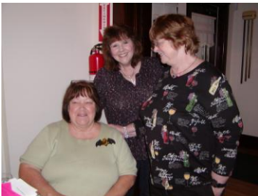
The gals are assuring her she is in for a good time.

The next paint-in was held at Unkorked in Wentzville - there we had 15 in attendance.