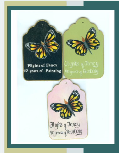
SDP GIFT TAGS APRIL 3 AFTER MEMORY BOXES