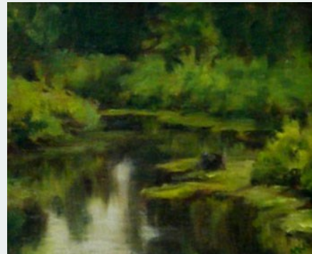
Shades of Green on a Hot Summer Day