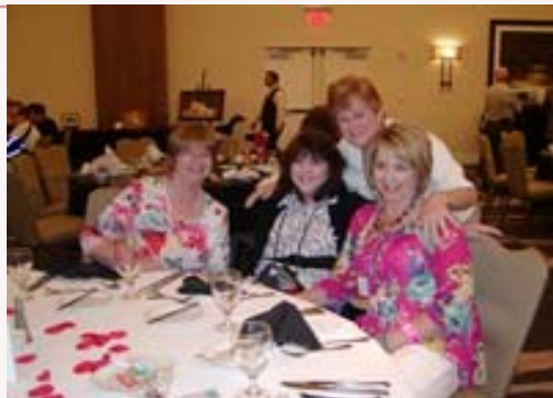
Convention Chapter Night Fun