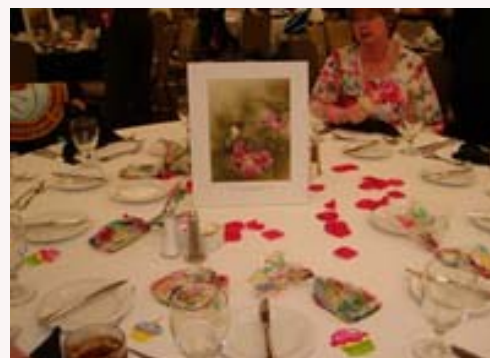
Gateway Table Decor