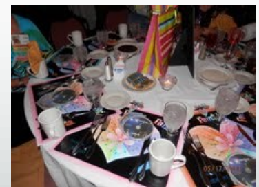
Decorated banquet table with the Gateway Mats

This is a picture of the pair that will be available for ownership. Buy a ticket so you can be the proud owner.