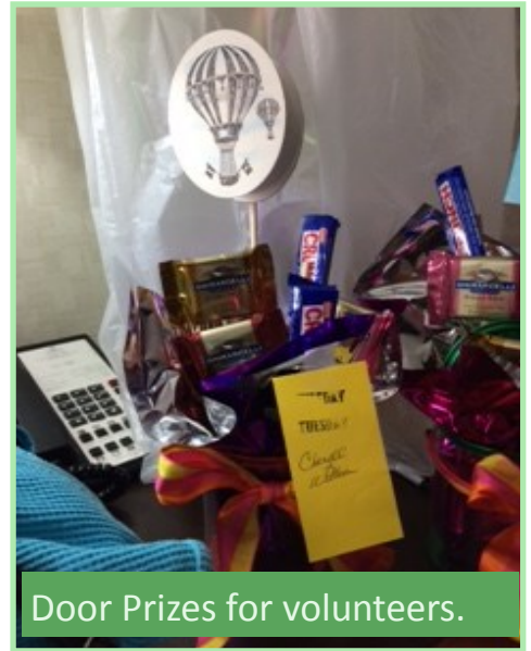
Door Prizes for volunteers.

The gals are back from convention and it looks like they had a good time.