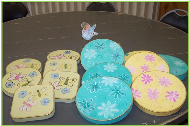
Even while having fun the gals found time to paint for their favorite charitable project.